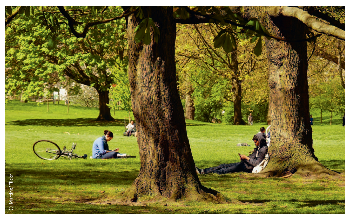
FIGURE 2: Nature-based solution approaches can promote the development and management of urban ecosystems to offer sustainable and cost-effective solutions to societal challenges like global warming, water regulation and human health, while enhancing biodiversity. Here, the Green Park in London.