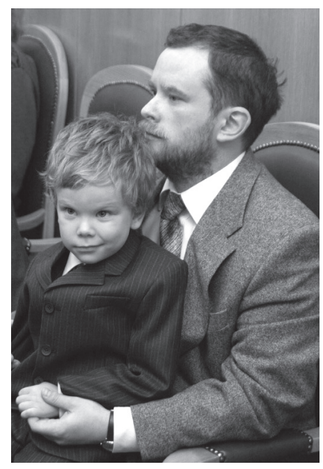
Russia prize 2006 – future AE member!

of methods for small-angle scattering data analysis and interpretation and in particular development of rapid protein characterization method using small-angle scattering data. Analysis of biomacromolecule structure in solution"