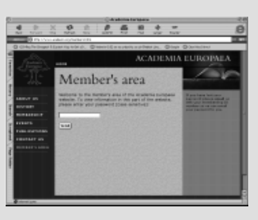
See page 12 to obtain your Member's area password