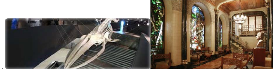
Visit to the CercledelLiceupinacotheque

The BHK-AEoffered a lunch in honour of the MAE and members of the YAE.